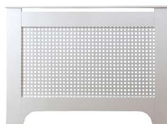
Medium Radiator Cover