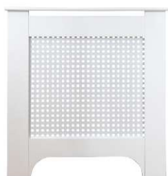
Mini Radiator Cover